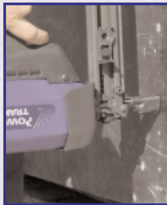
Plywood to concrete or block