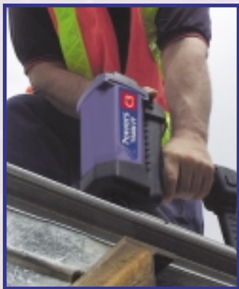
Steel Framing to concrete, block or steel