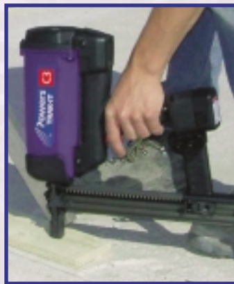
Wood to concrete or block