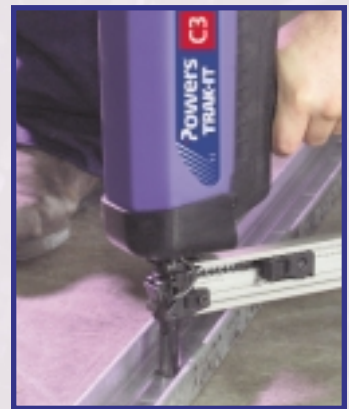
Drywall track to concrete block or steel